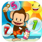
Monkey Math School Sunshine £1.99 (iOS) £1.79 (Google)