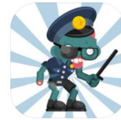
Math Vs Zombies Free (iOS) Free (Google)