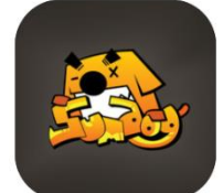
Sumdog Free (iOS) Free (Google)