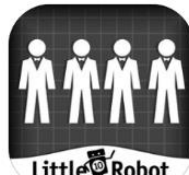
Operation Math Code Squad £2.99 (iOS) £2.69 (Google)